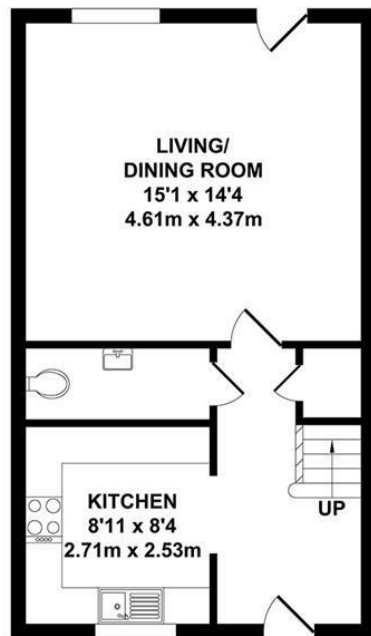
GROUND FLOOR APPROX. FLOOR AREA 410 SQ.FT. (38.08 SQ.M.)